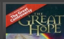
Part 8 Apologizing to Rome