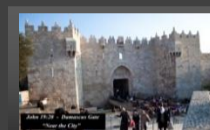
Part 7 Islam & Judaism