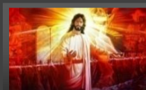
Part 4 Zip Code: Silver Spring