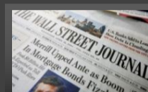
Part 6 Contacting the media