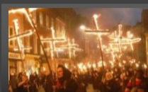
Part 3 The Jesuits