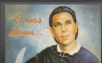
Part 2 Totally ignored