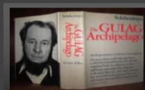
Part 5 Stop the applause